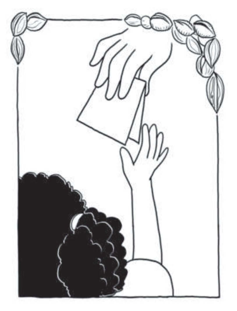
"Kate, take this note to Rose. I hope Rose has nuts."