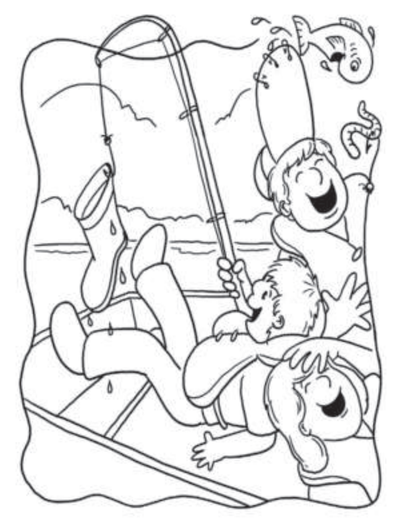
Tad tugs and then plop! This is not a fish!