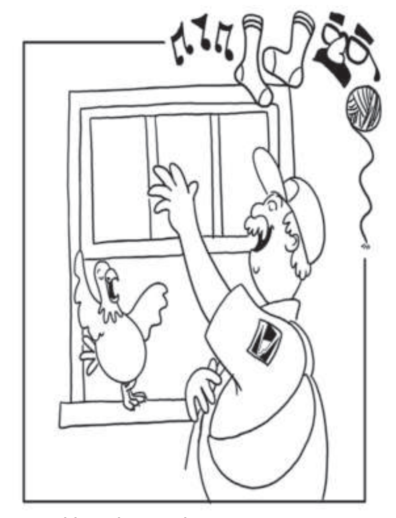
Bing likes the mailman. Bing tells him a chicken joke. Bing's joke makes the mailman smile.