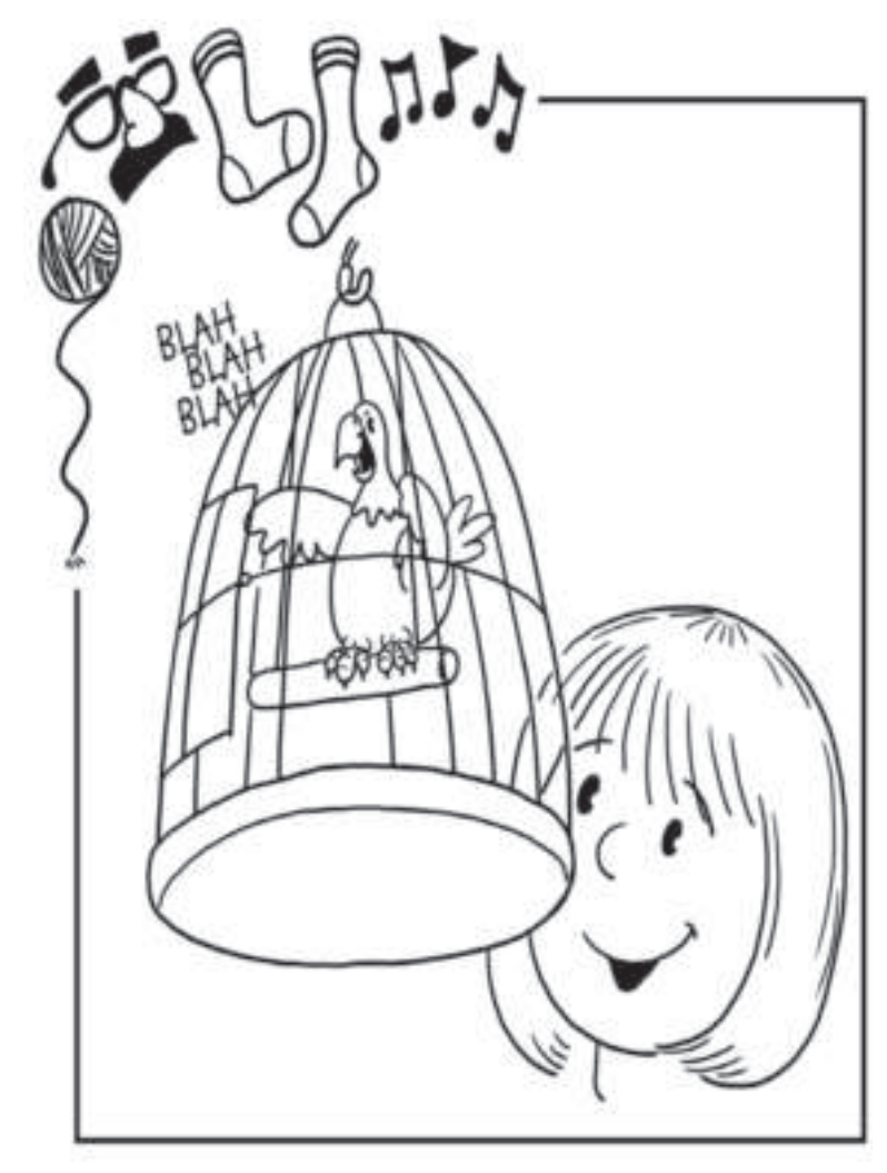
Liz's bird is named Bing. He is big and gray. Bing likes to sit and talk.